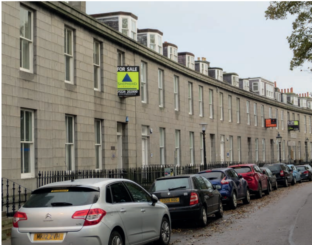
Bon Accord Crescent properties on the open market

This document provides parameters for development along established lanes within the City Centre , part of the Albyn Place / Rubislaw Conservation area , and for new development along lanes in new masterplanned areas (refer to map at Appendix 1) . The advice encourages the creation of residential mews buildings in specific areas, although the forms of development advocated may also be appropriate for a range of other uses, if in accordance with the Aberdeen Local Development Plan.