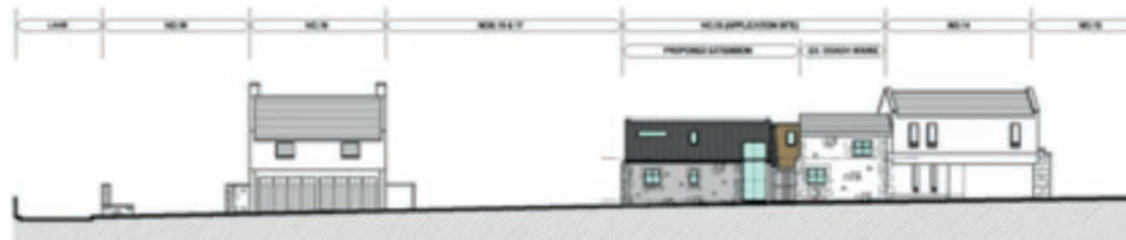
Examples of new mews building as part of the comprehensive redevelopment of 15 Bon Accord Crescent (Courtesy of Neil Rothnie Architects)