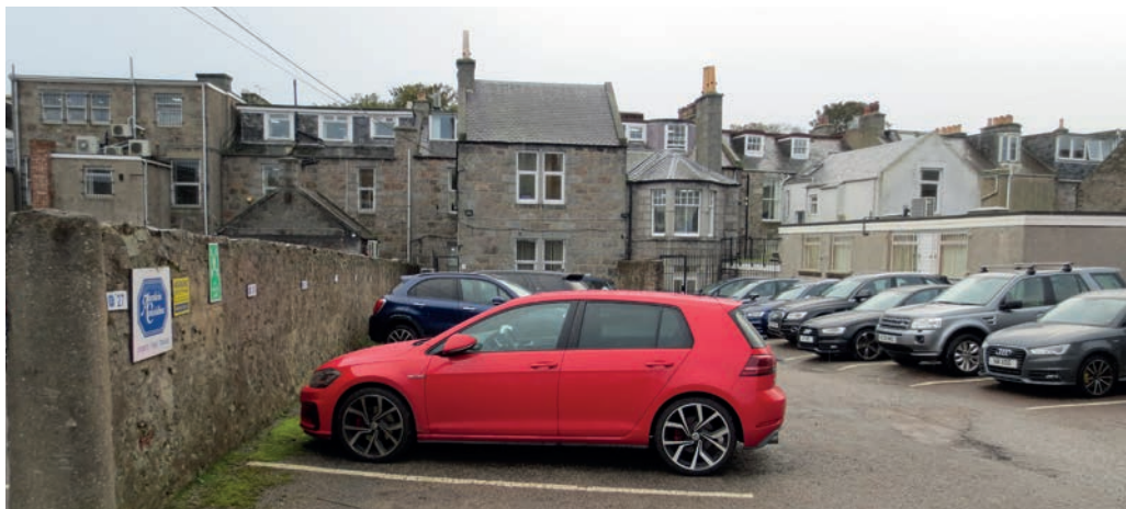
Bon Accord Crescent Lane boundaries removed to accommodate car parking

1.2.5 The parameters provided in this advice are also applicable to development along new lanes within masterplanned areas where lane characteristics should form part of a well-designed hierarchy of a place and movement network, and where a greater range of different dwelling types provides choice and improves whole-life options for the creation of sustainable communities.