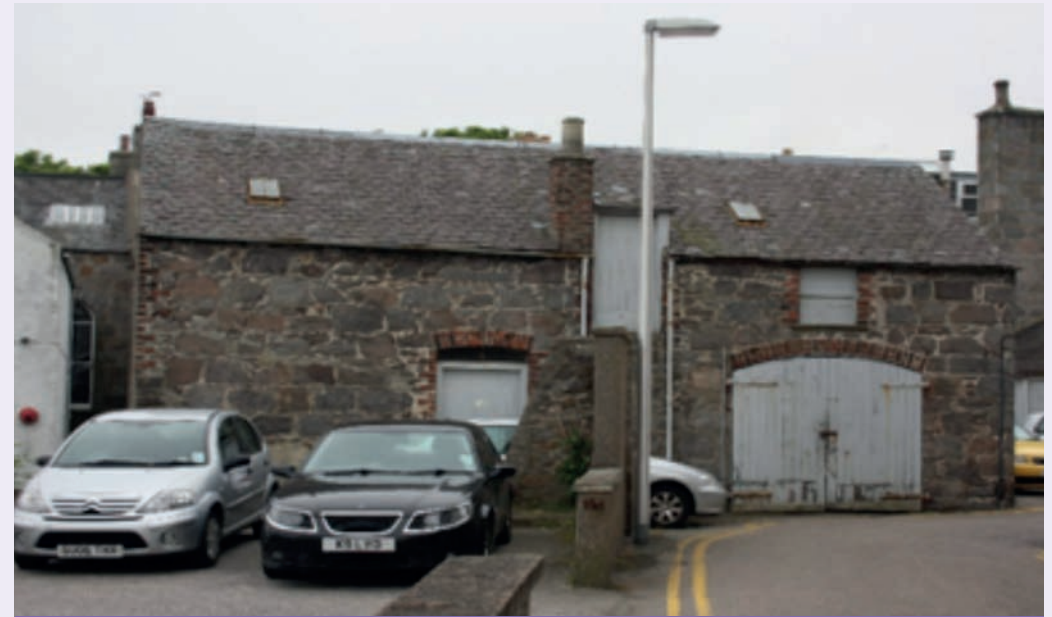
Original mews building on Bon Accord Cres Lane