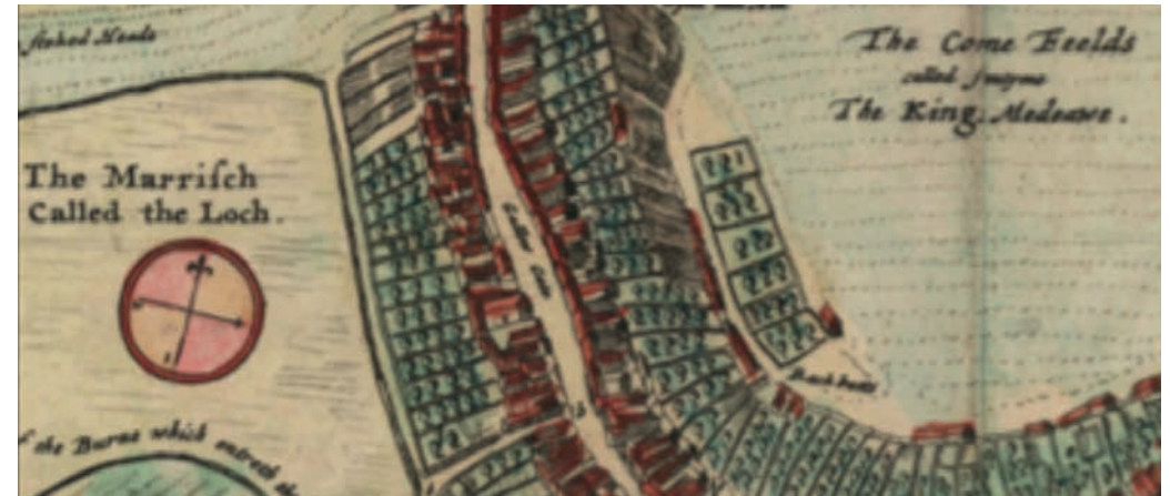
Extract from Parson Gordon's Map of Aberdeen 1634 showing lanes and mews off the Gallowgate area

1.3.1 Lanes have always been part of the urban development of Aberdeen as a necessary means of servicing a larger planned network and their use can be traced back to medieval times. In the Georgian period the planned urban environment was organised to reflect social hierarchies with people and uses segregated according to social class and use hierarchy. Historically, the grandest of properties would have the lane at the rear of the feu edged with a mews building, being two-storey and accommodating carriages, horses, general storage and sometimes with living accommodation above. Today there are remnants of mews buildings along Bon Accord Crescent Lane, Albyn Lane and Queens Lane North and South, however many have been lost to the demands of in-curtilage car parking. By the time the greater part of the West End was complete mews buildings were no longer required for their original purpose.