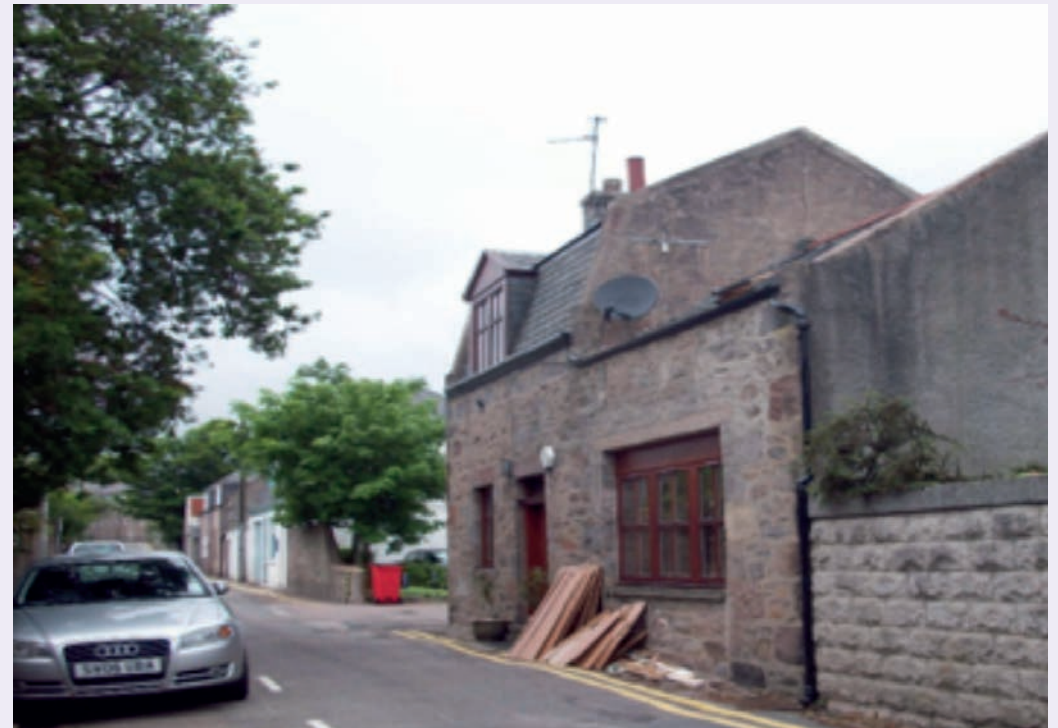
Residential mews buildings along Albyn Place Lane

2.5.3 Masterplan Zones – Sites within the Aberdeen Local Development Plan's Masterplan Zones should consider in-curtilage car parking in the form of garaging integral to a mews development and with the garaging serving no more than the residence above in order that residential amenity is not compromised. The provision of garaging that serves nearby property will require robust justification.