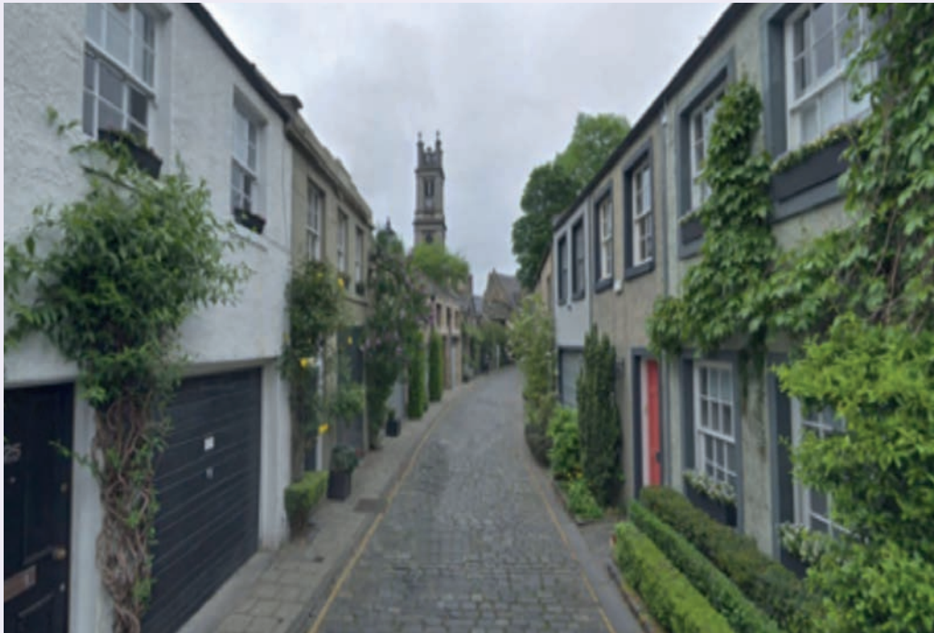
Historic mews in Stockbridge Edinburgh converted into attractive dwellings with minimal setback enabling some soft landscaping to enliven the lane