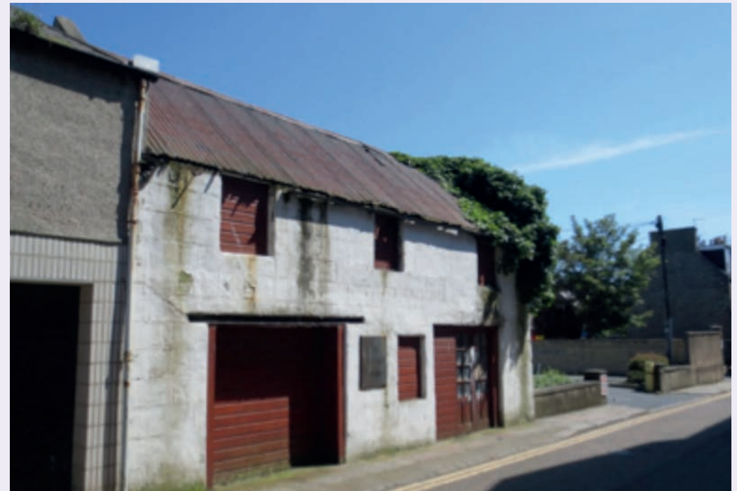
Original mews building on Gordon Street