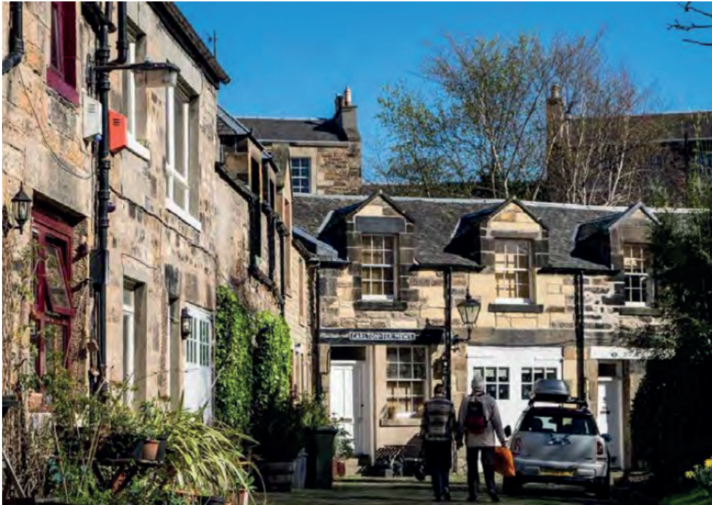
Calton Terrace Mews, Edinburgh, where the collection of mews around a shared central green gives the impression of a distinctive place and community

1.3.3 Mews buildings today, either as a reworked existing, or new building, remain as an appropriate form of small-scale development both within historic and newly planned areas. They offer the opportunity to have an attractive home close to amenities and whose form, of relatively small-scale living, gives an attractive contrast and diversity to the surrounding properties. When grouped together should foster a strong sense of community.