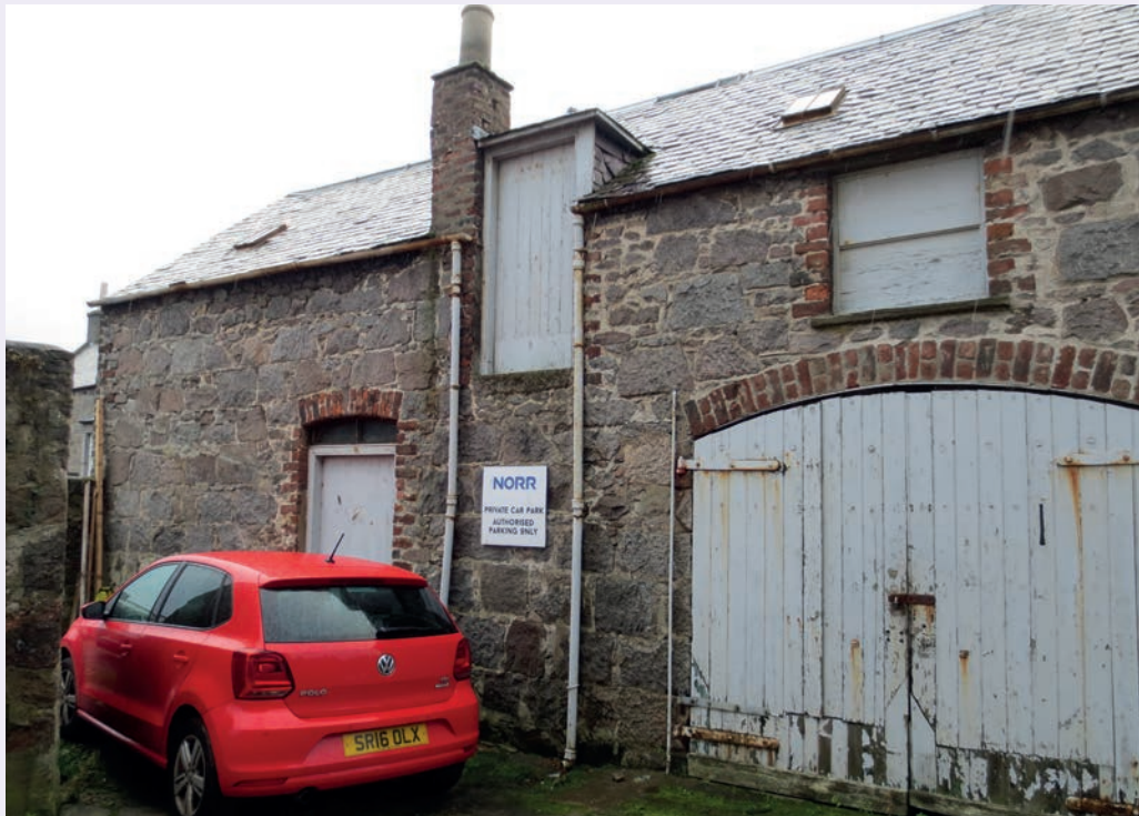
Original mews buildings on Bon Accord Crescent Lane