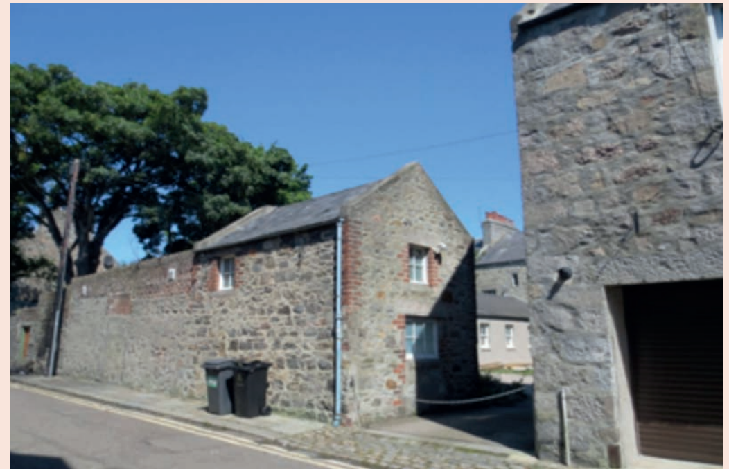
Original news building in Gordon Street now converted into a home as part of an entire feu redevelopment.