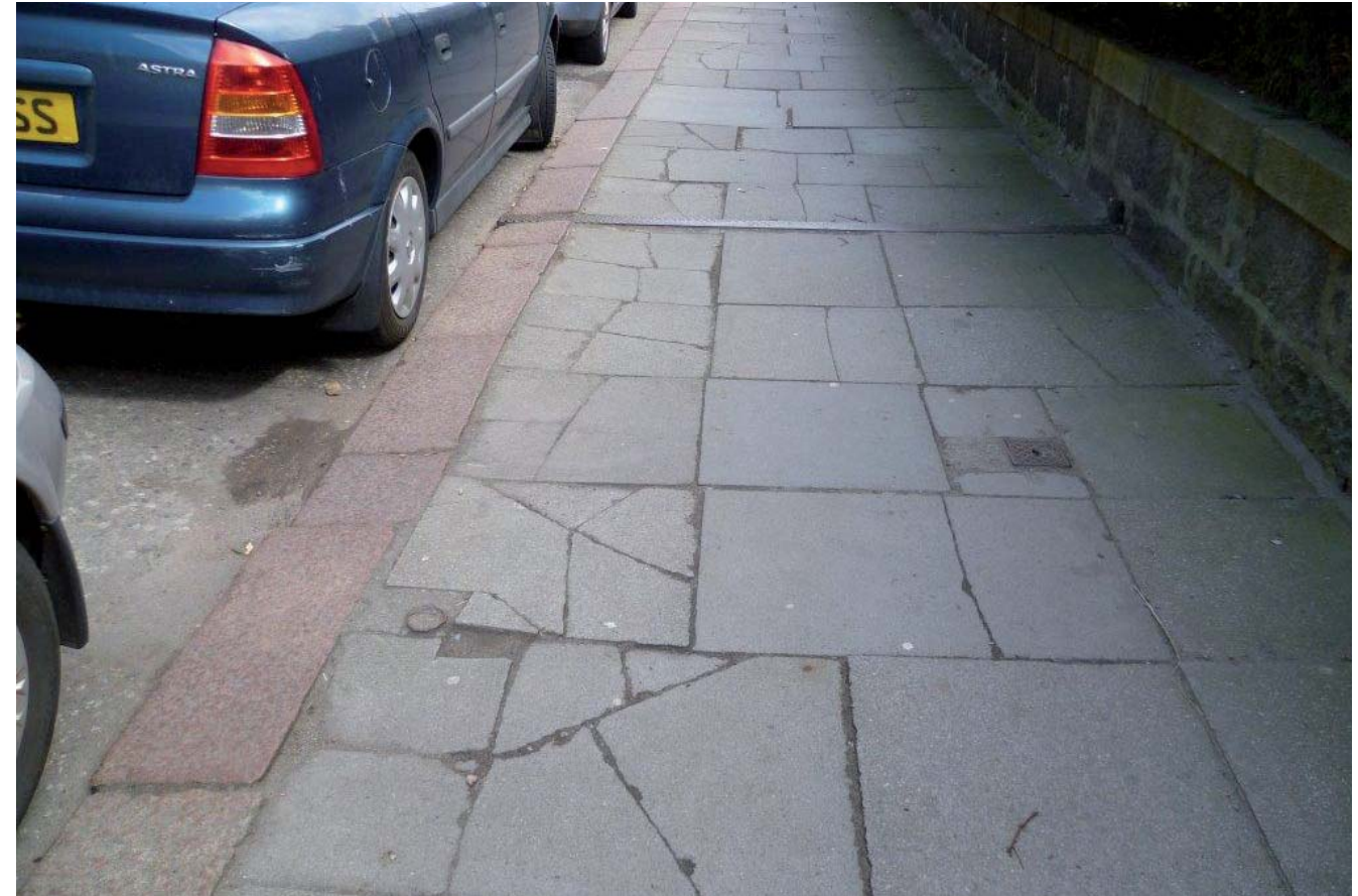
Victoria Rd (damaged slabs)