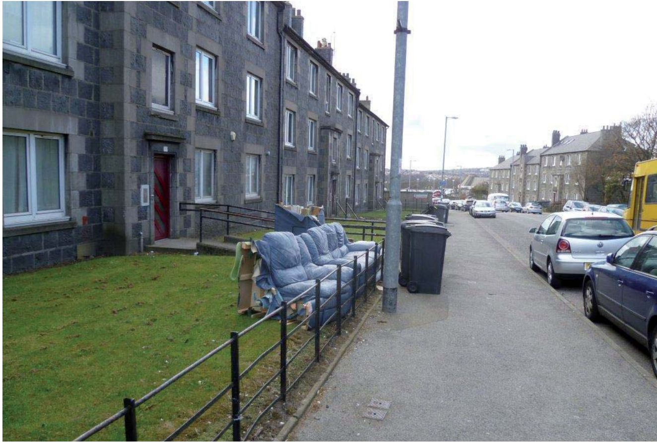
Balnagask Rd (rubbish)