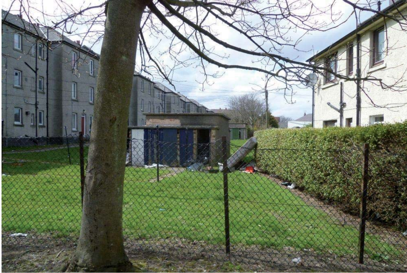
Tullos Place (rubbish left in cellars)