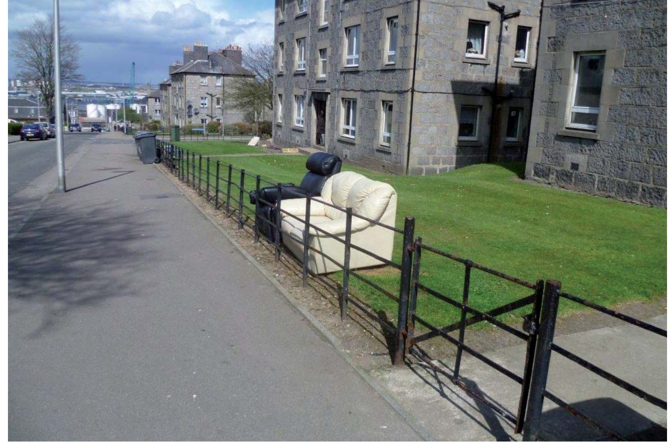
Mansefield Rd (Rubbish)