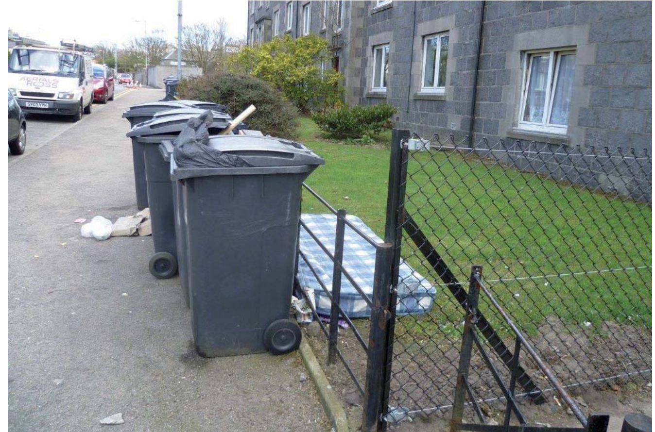
Balnagask Rd (rubbish)