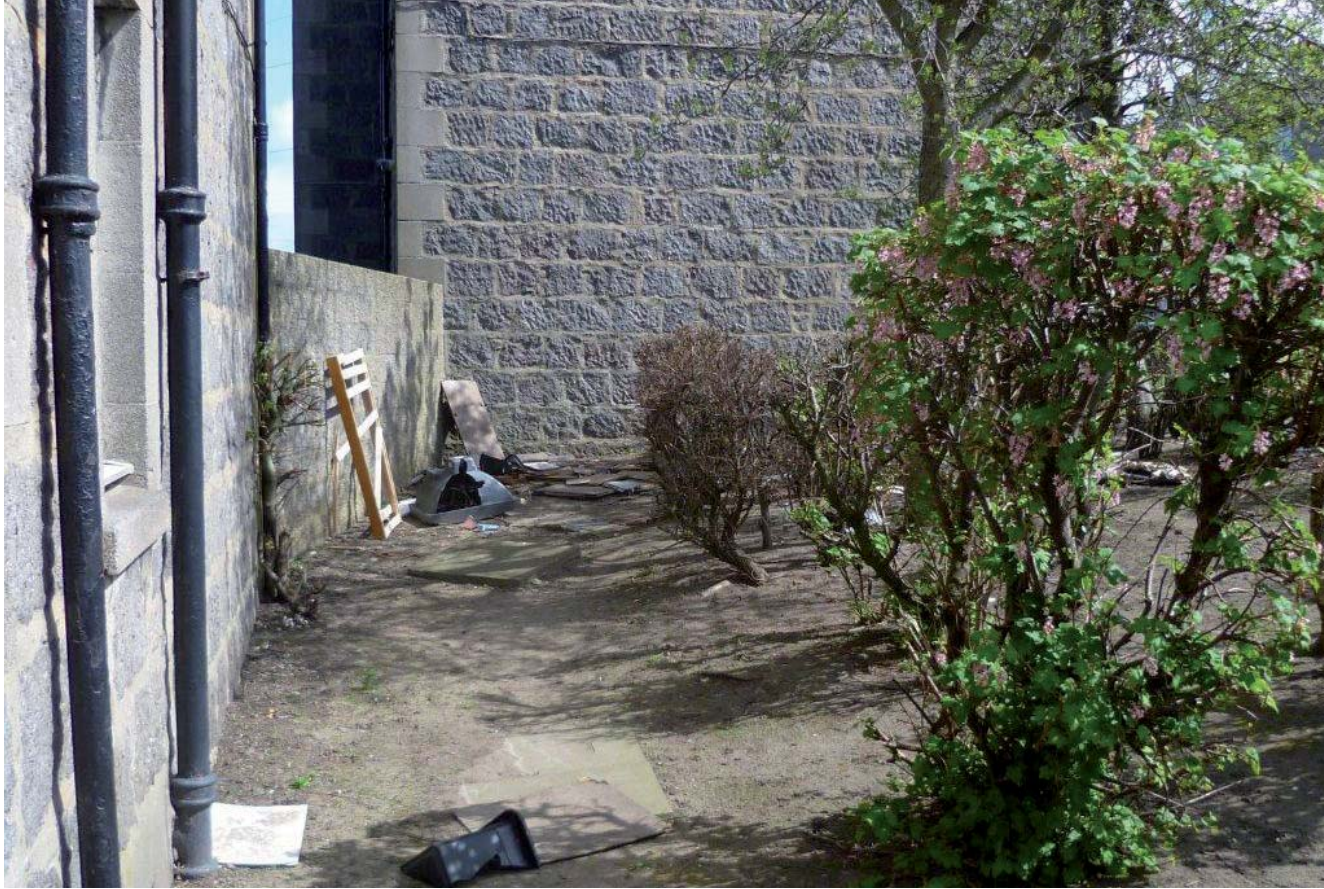
Corner of Mansefield Rd (Rubbish)