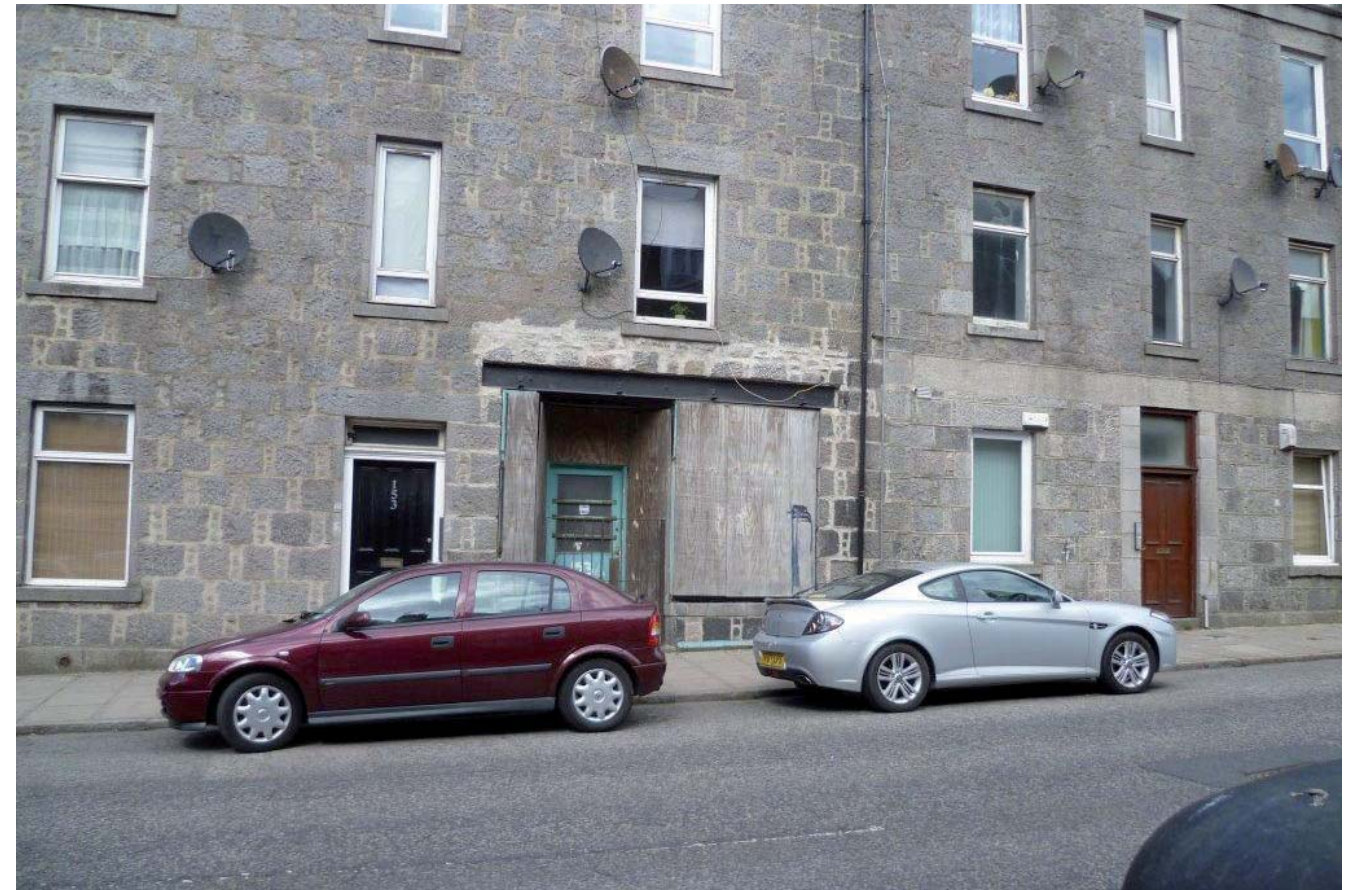
Victoria Rd (derelict empty shop)