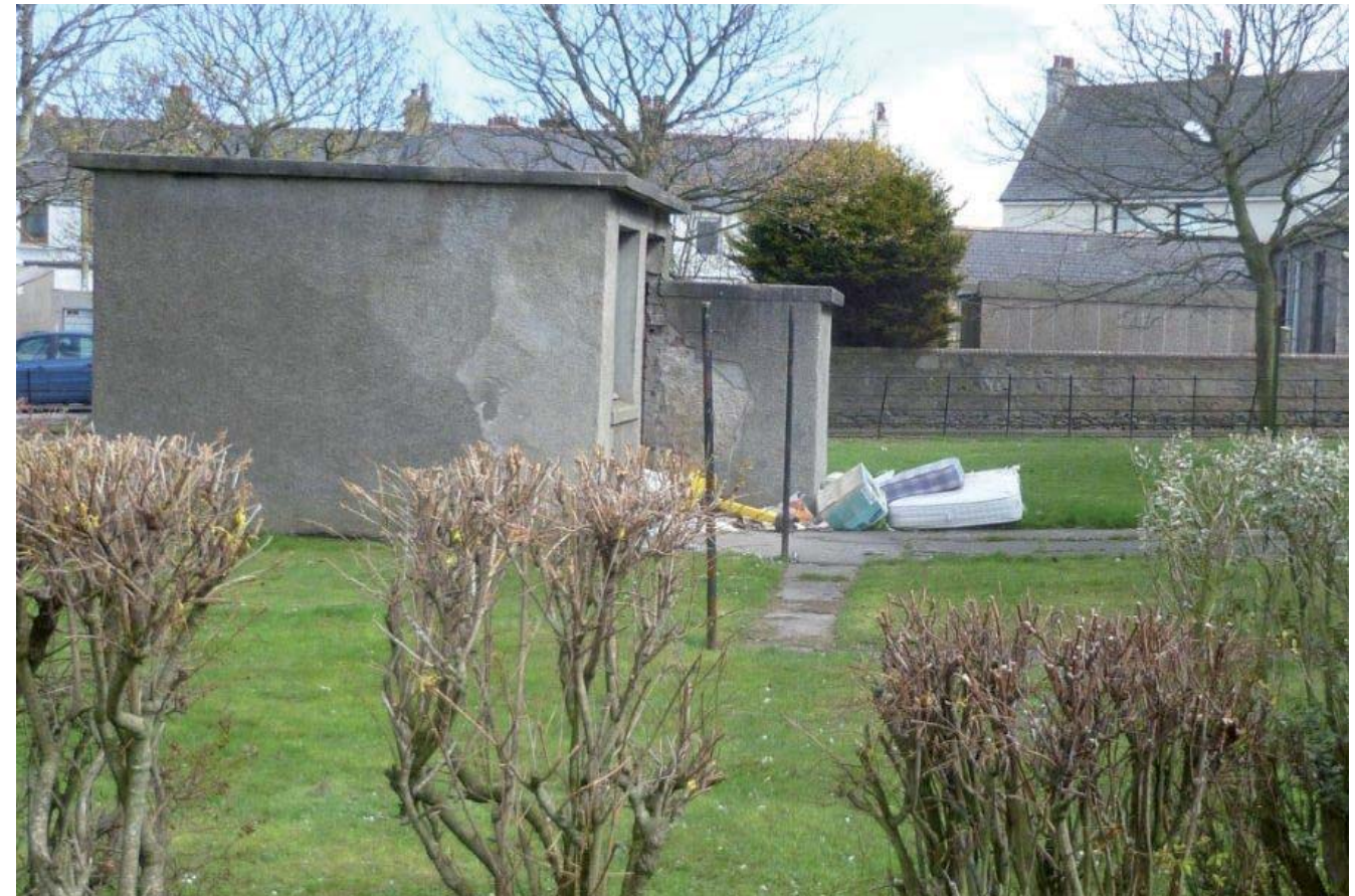
Tulloch Place (rubbish in old cellars)