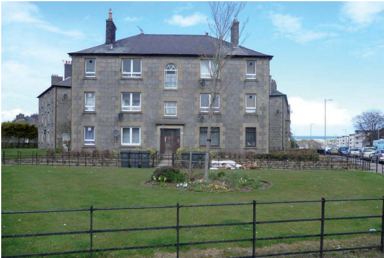
Balnagask Rd (rubbish. grass maintained by residents)