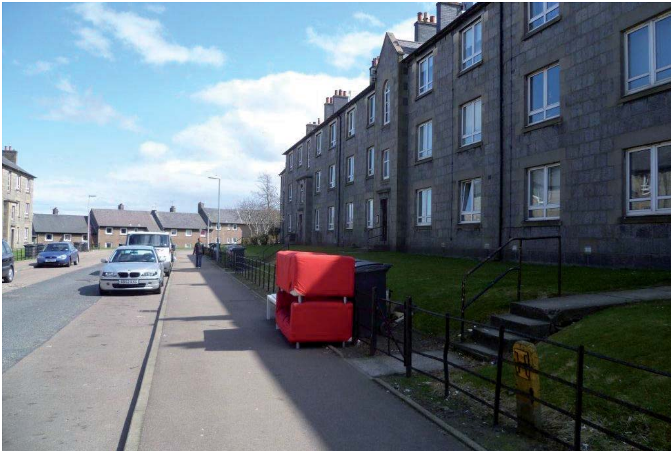
Girdlestone Pl (rubbish)