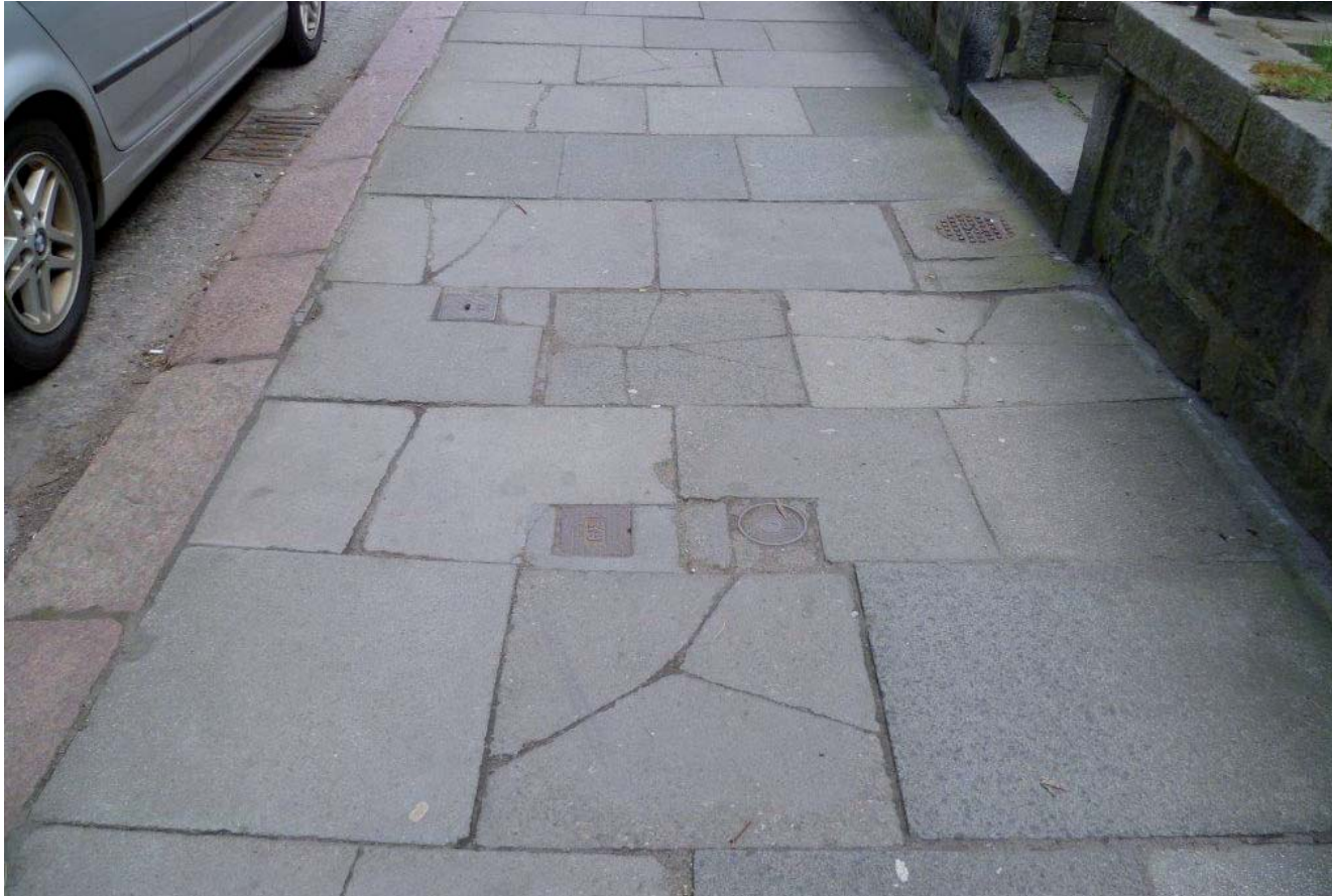
Victoria Rd (damaged slabs)