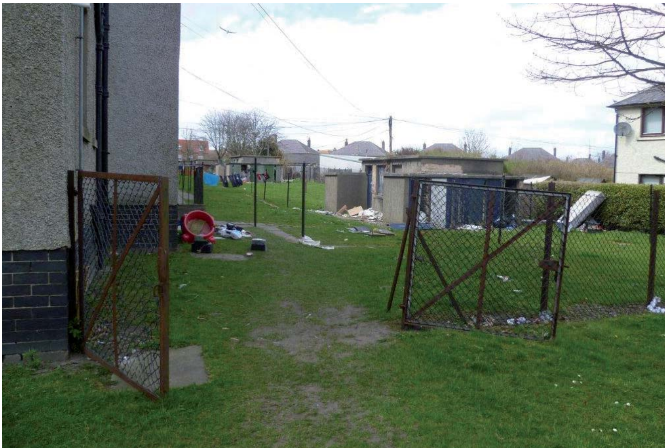
Tullos Place (rubbish left in cellars)