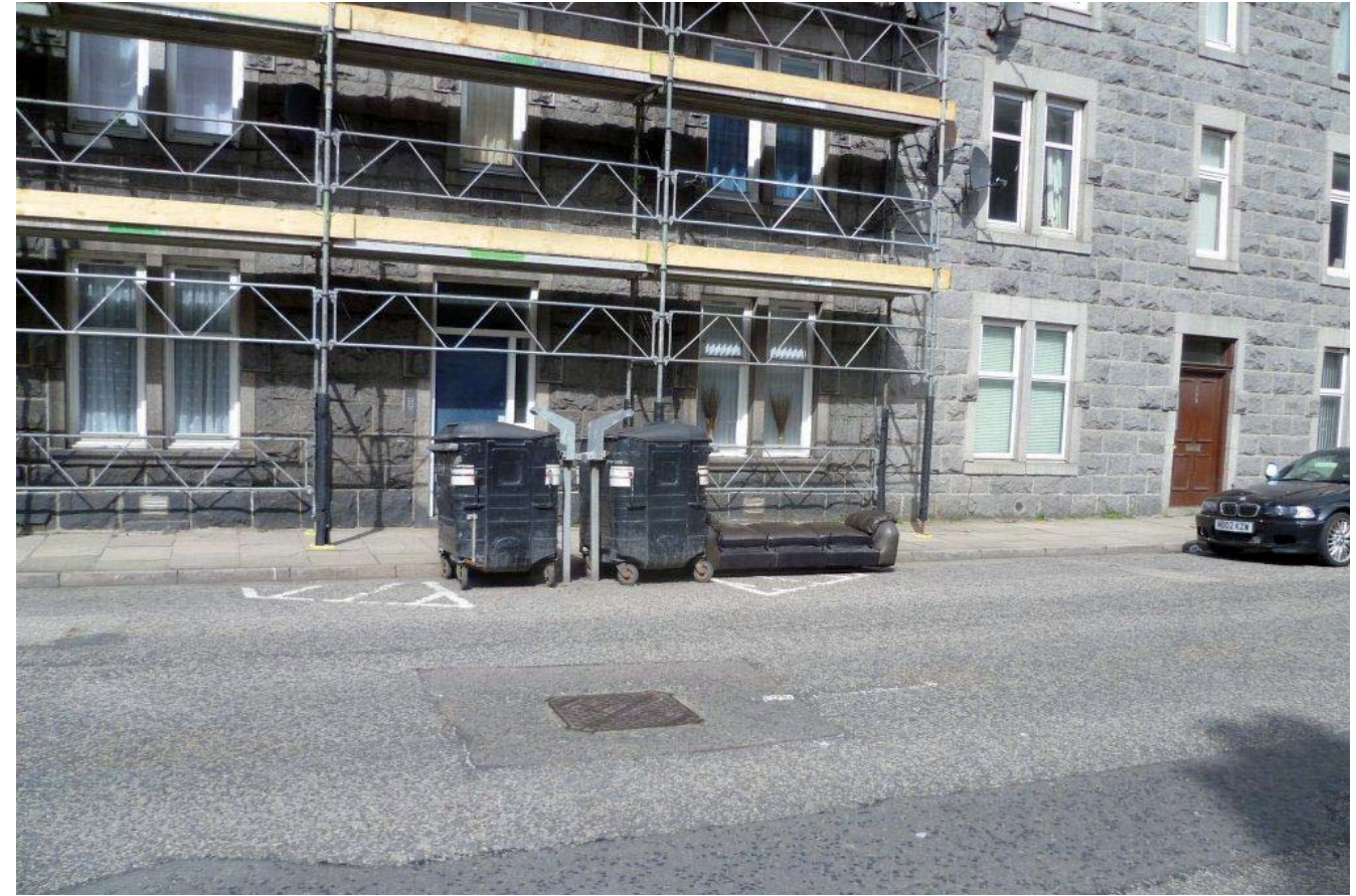
Victoria Rd (rubbish)