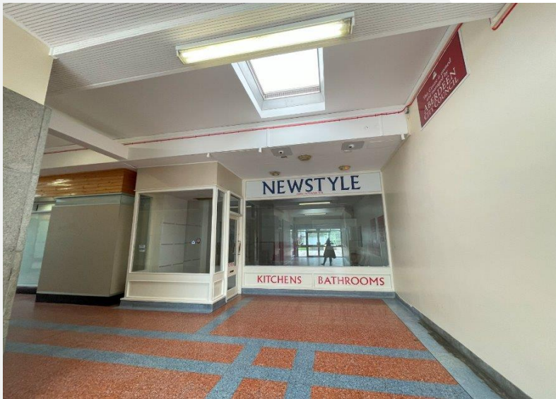
UNIT 7 (ACCESSED INTERNALLY)

The subjects comprise a ground floor retail unit contained within the Kincorth Shopping Arcade. The premises is located internally within the arcade and is accessed by the main front entrance to the arcade. The premises comprises an open plan unit suitable for a range of retail and professional service users.