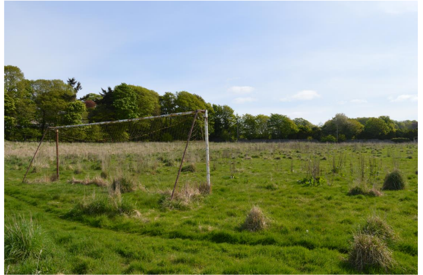
View looking north east across the site