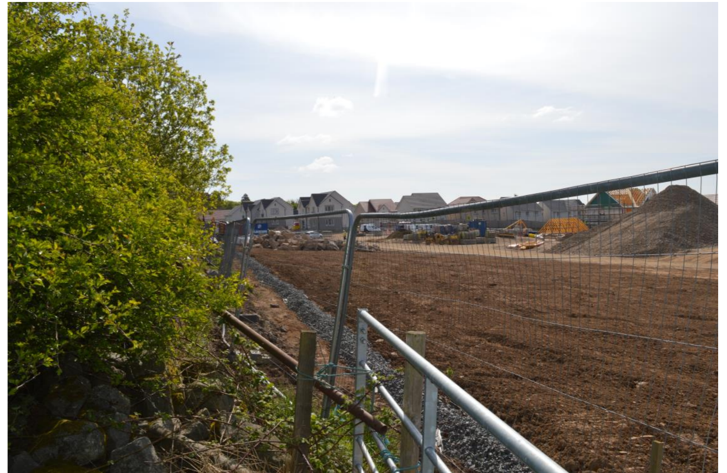
View looking south east from the site towards new link road