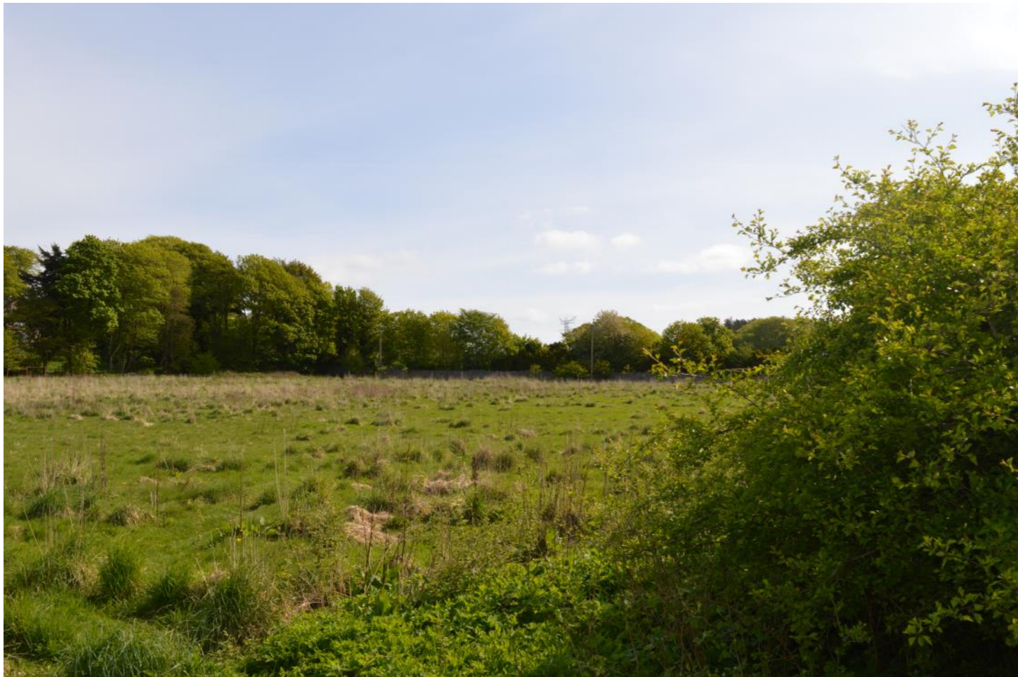
View looking north east across the site