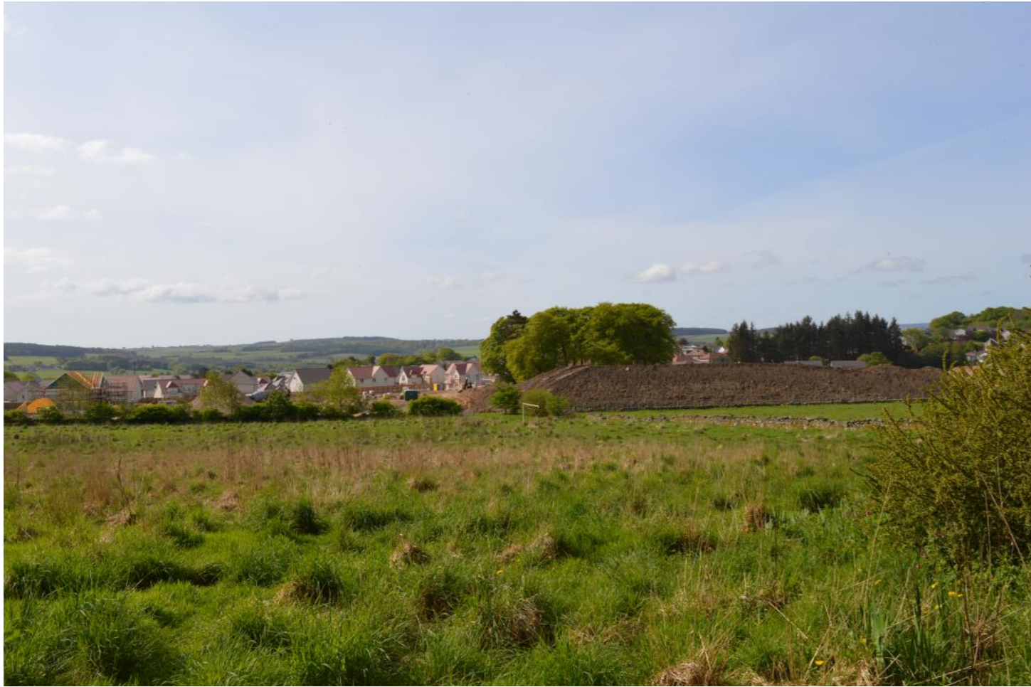
View looking south across the site