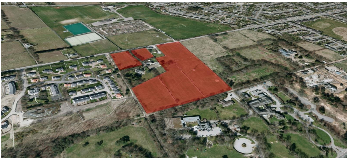
Aerial view of the site. Showing development on the west, south and north.

Sympathetic development, including landscaping and footpath connections could have a positive impact on the usability of the area for cyclists and pedestrians, who have to rely on the road network around the site at present.